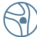
Thrombotech™ Synthetic Clot