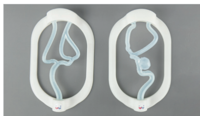
Clear Cartridges - Standard Frames

Ischemic Stroke: Mechanical thrombectomy Aspiration thrombectomy