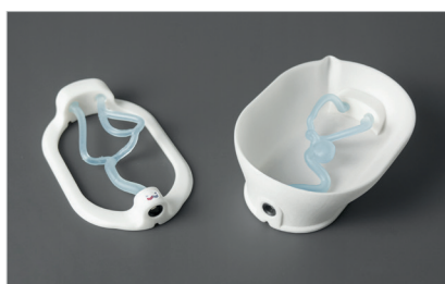
Clear Cartridges - Standard & Tank Frames

Train for all unruptured aneurysm and ischemic stroke procedures Transparent material designed for use without fluoroscopy Compatible with all EVIAS™ stations Standard frames for improved lateral visualization and convenience Water-bath tank frames for improved transparency of the anatomy