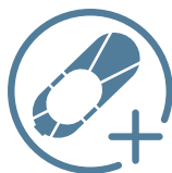
EVIAS™ Plus Station